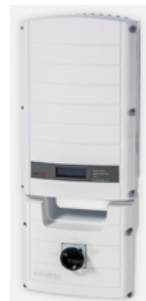
inverter in EC370